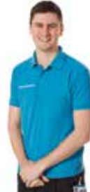
Therapy services team